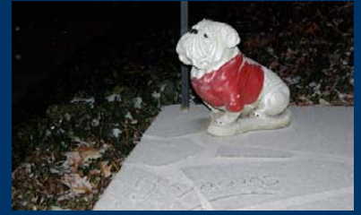
Even Bulldogs love winter in Fresno!