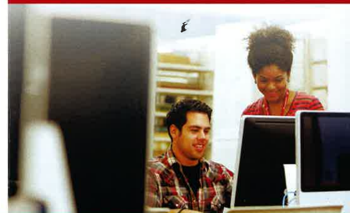
PROGRAM JOB OPPORTUNITIES

This one unit class includes various activities to improve writing, grammar, punctuation, editing and revising skills